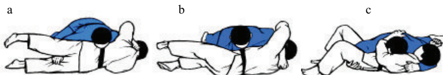
3. Turnover into Yoko-shiho-gatame