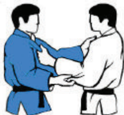
1. Standard grip